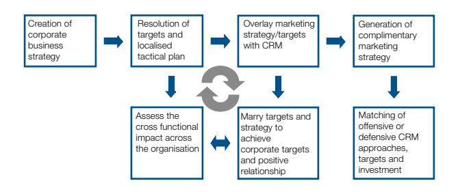
Fig. 1. Developing the foundation of complimentary CRM and marketing strategies

Most by now will recognize the dis-function in marketing and CRM. The problem for many is how to best resolve the issue, bridging the gap in communications, blending the strategies and targets together, so that positive cash flow is yielded and targets are affected. It has to be a marriage of business process and technology.